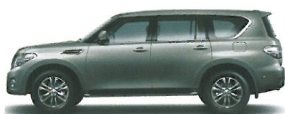
Grayish Green (PM) / JAE Vert Gris   (NM) / JAE