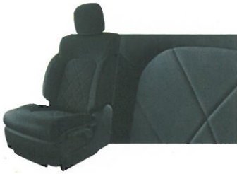
Black Cloth Tissu Noir