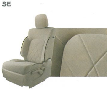
Beige Cloth Tissu Beige