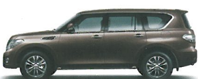
Brownish Purple (P) / L50 Violet Bruni (N) / L50