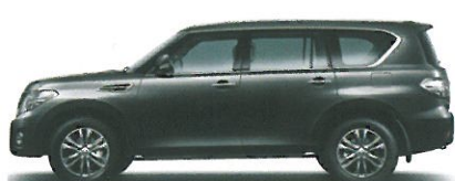
Black / KH3 Noir / KH3