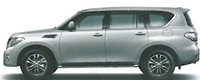
Brilliant Silver (M) / K23 Argent   clatant (M) / K23