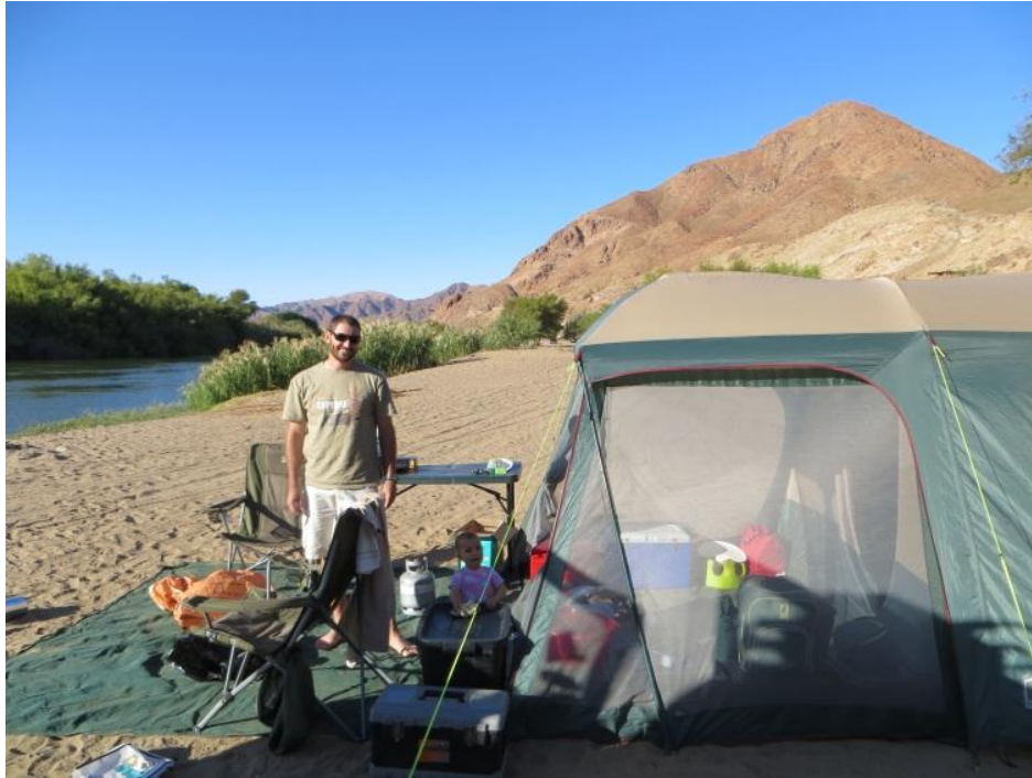
The packing has started.