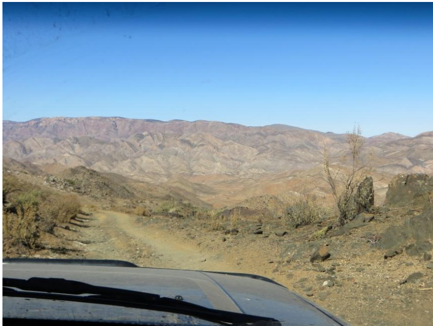
Road to Helshoogte Pass