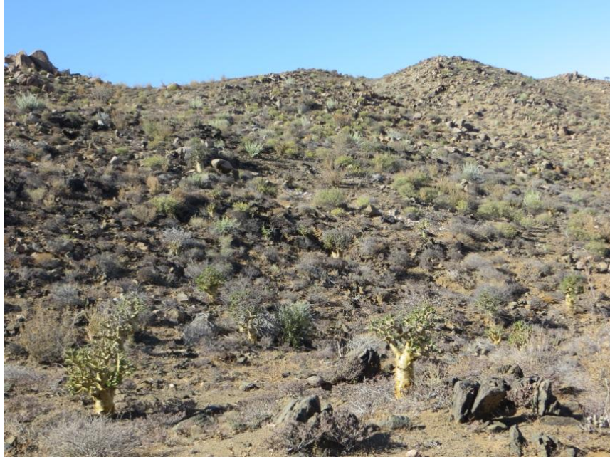
Plant near Helshoogte Pass

Sendelingsdrif and out that way. He drove an old SFA Toyota Hilux and it must be bumpier than the Patrol, because we had no problem with the pass. Actually it was a bit disappointing road wise, scenery wise it was very nice. The plants were totally different to what we grew accustomed to the last view days the closer we got to the pass.