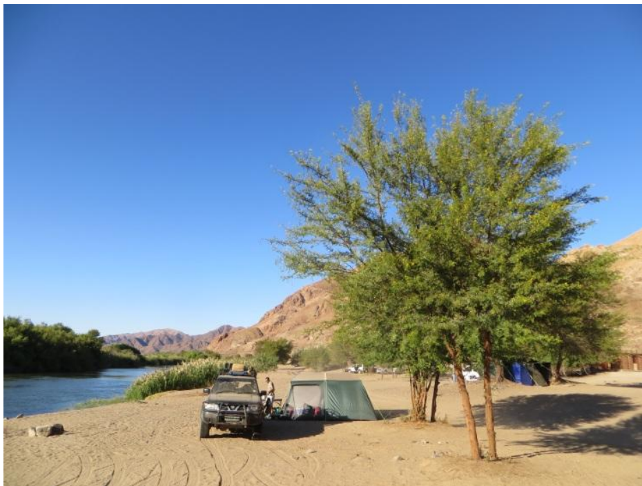
De Hoop campsite.

We left De Hoop at 10:00 and tried to make progress as quick as possible. Helshoogte Pass was not as bad as we expected. We spoke to a guy we met at Potjiespram campsite when we arrived at De Hoop and he said that it was a long bumpy road and he will rather go round over Akkedis Pass to