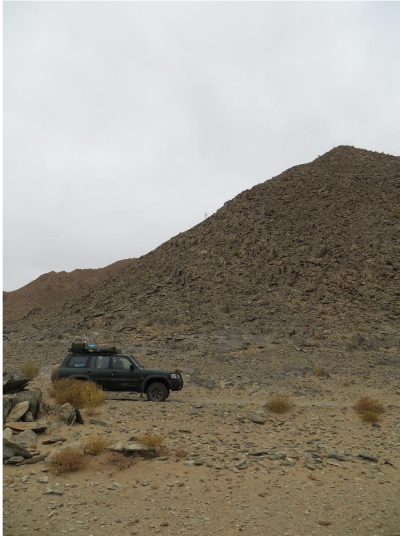
Just outside Potjiespram campsite

Just after the turnoff on the road from Sendelingsdrif we came across our first Halfmense ( Pachypodium namaquanum ). We were probably like a first time visitor to the Kruger Park that sees an Impala. We stopped and took photos, but later on they were all over and it was nice to see them but no more stopping and photos.