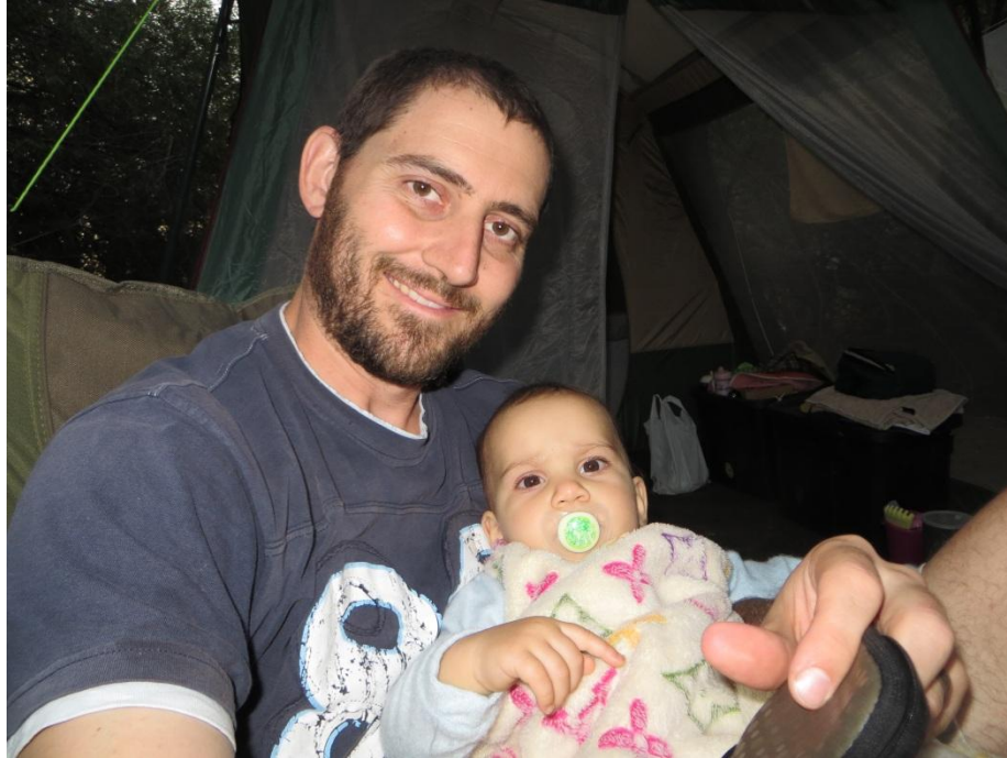
Father and daughter enjoying the sunset.

We had a nice braai the evening to end a very nice first day in the Richtersveld. The only trouble we had with Potjiespram campsite was the road on the Namibian side on the other side off the river. At some stage an ambulance or something with a siren came past. There were also some dogs barking on the Namibian side.