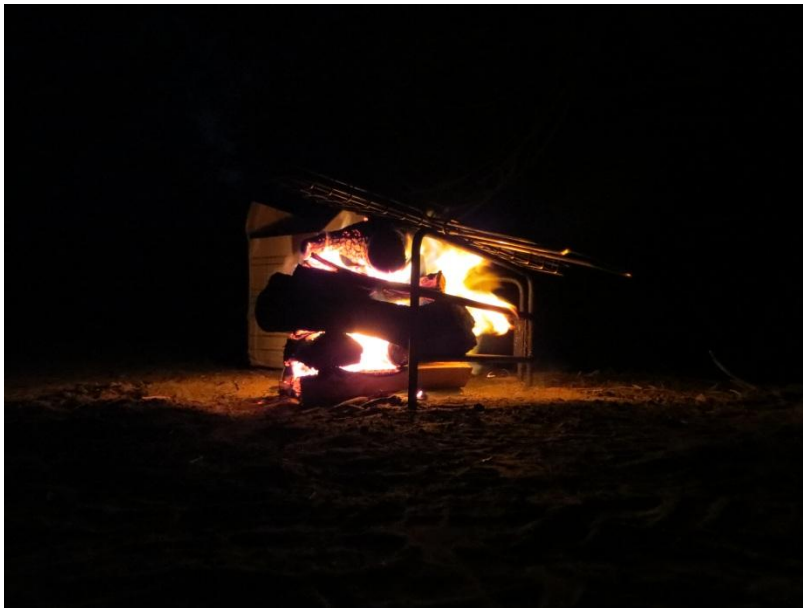
Cleaning the grill

We had a nice braai the evening to end a very nice first day in the Richtersveld. The only trouble we had with Potjiespram campsite was the road on the Namibian side on the other side off the river. At some stage an ambulance or something with a siren came past. There were also some dogs barking on the Namibian side.